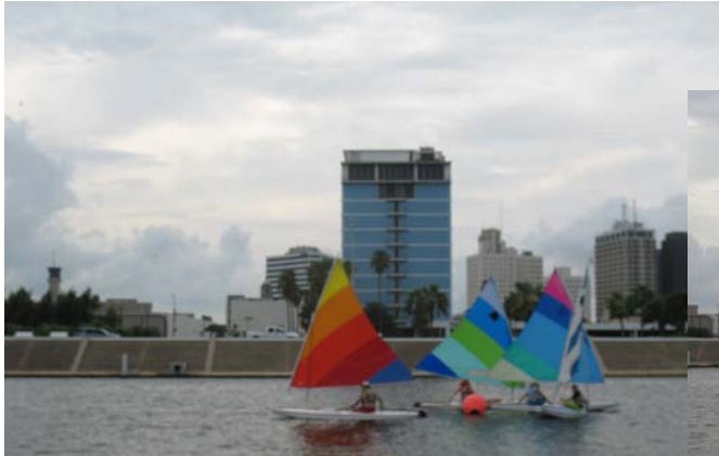
Fun with the Sunfish and partying with the BYC at the Ingleside Bastille Day celebration