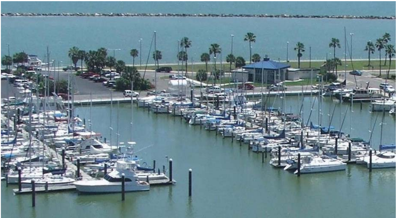
The Texas International Boat Show on the Lawrence Street T-Head