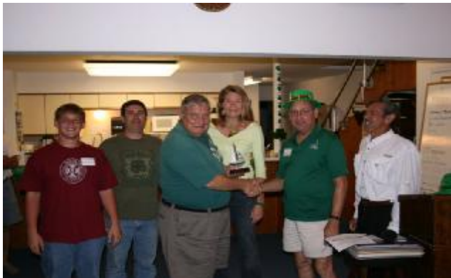
WARRIOR 1st Place!!!!!!