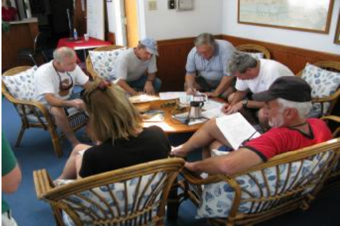
Forms, Forms, Forms.