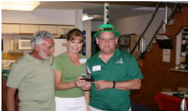
Ragtime 3rd Place !!!!!!