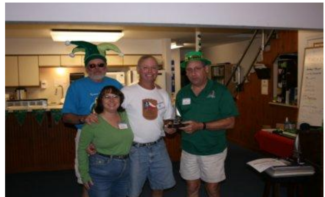
Pazuzu 2nd Place!!!!!!