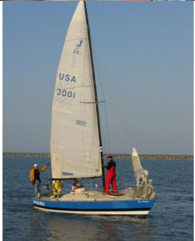
"Pazuzu" is Lookin' Good!